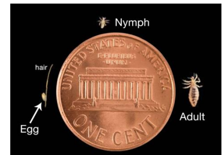
Head lice with a penny for reference