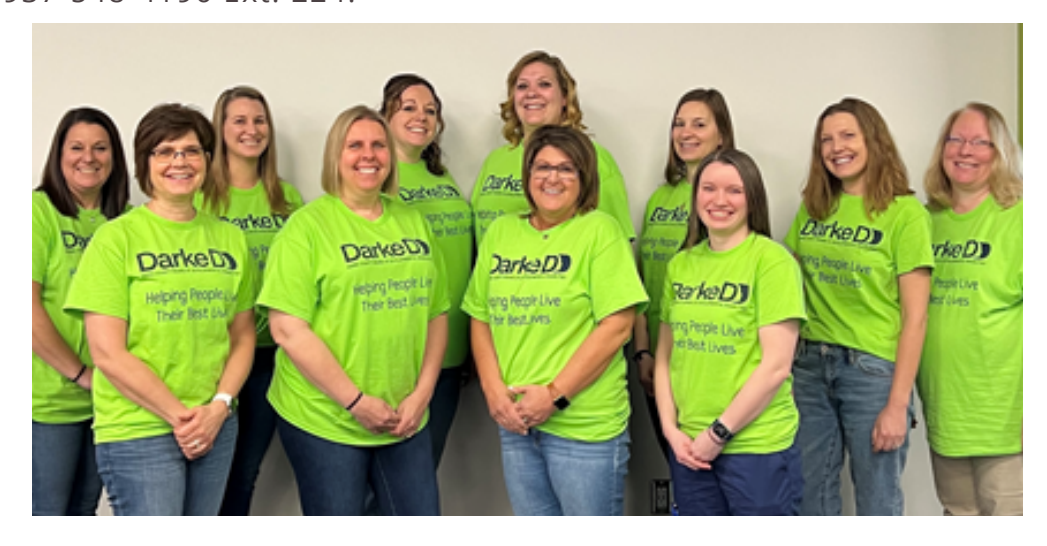
Shown above is the Darke County Early Intervention Team

Students under the age of 18 need to be accompanied by a parent or guardian. Those 18 and over must wait 15 minutes after the vaccine if they are driving themselves. For any questions or additional information on this clinic or state vaccine requirements, please contact the Health Department at 937-548-4196 Ext. 224.