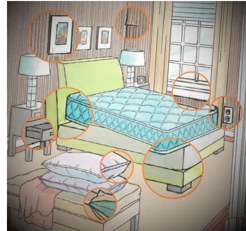
Places where bed bugs like to hide